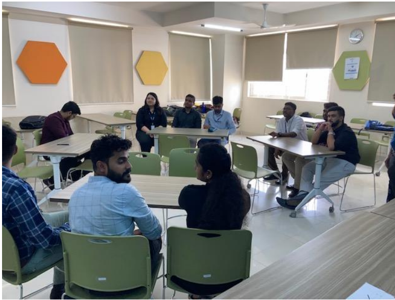
Figure 2 discussion on product selection