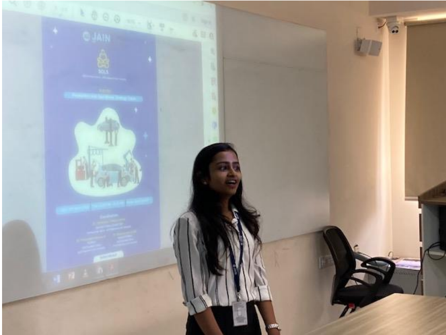
Figure 1 SOLS club activity

Caption for the photographs to be returned as per the format forwarded from University IQAC Department for all the photographs in the reports for the period 2020- 2021